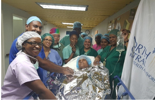
The surgical and support team at the EWMSC show support for this patient after successfully completing his surgery.

THE NCRHA cut a major slice off its backlog of surgical cases after 50 patients received life changing operations at the Eric Williams Medical Sciences Complex (EWMSC).