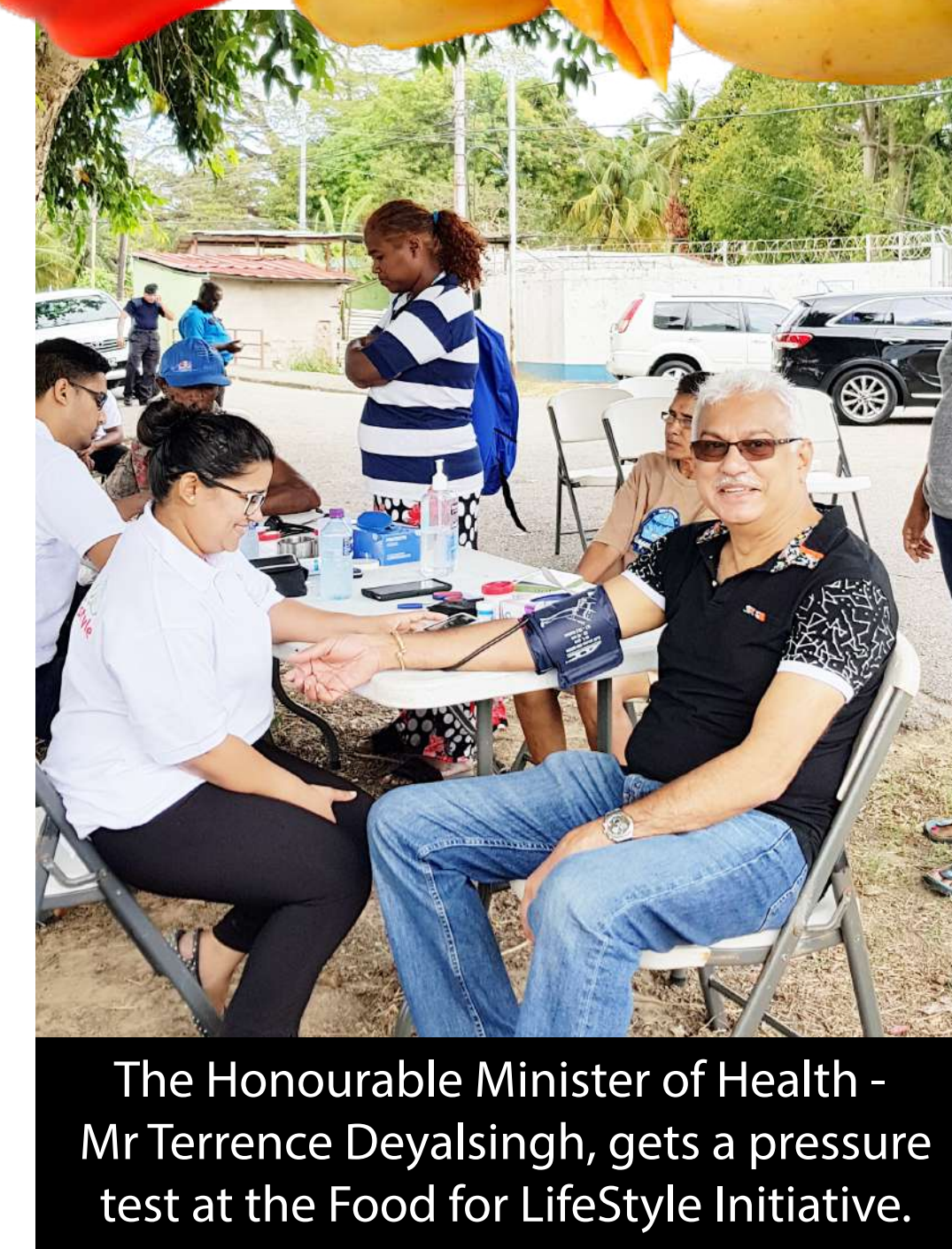
The Honourable Minister of Health - Mr. Terrence Deyalsingh, gets a pressure test at the Food for Lifestyle Initiative.